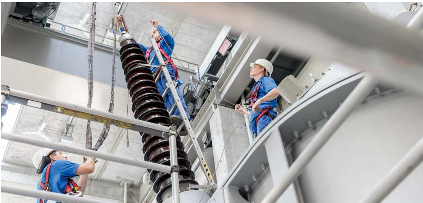
Our experts during the replacement of a high-voltage bushing with U_m = 300 kV at a 125 MVA grid connection transformer